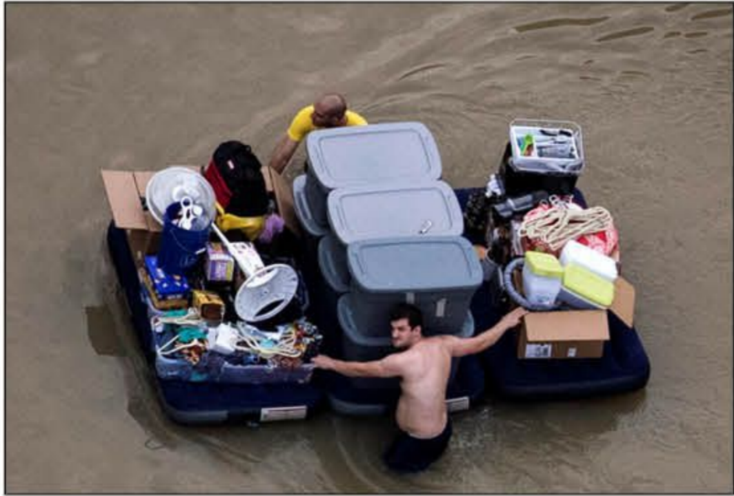
Residents wade with their belongings through flood waters brought by Tropical Storm Harvey in Northwest Houston, Texas on August 30.

On Thursday Harvey is forecast to move northeast through Louisiana into Mississippi, dumping 4 to 8 inches (10 to 20