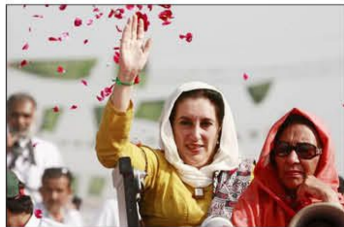
Pakistan's former prime minister Benazir Bhutto waves to supporters on her way to Shahdada Kot, where she was going to submit her nomination papers for national assembly to the district session court judge, some 515 km (320 miles) north of Karachi November 26, 2007.

Two other suspects, Ibadur Rahman and Al Qaeda's No. 3 financial and operational chief Mustafa Abu Yazid alias Sheikh Saeed Al-Masri, were